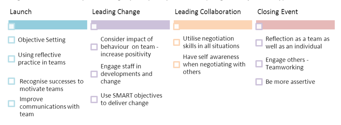
Diagram 2 – Themes of reported changes participants plan to make (categorised by Workshop)

Participants were also asked to give comments concerning any changes they planned to make following the events. There were many items reported but themes from the different events (Diagram 2)