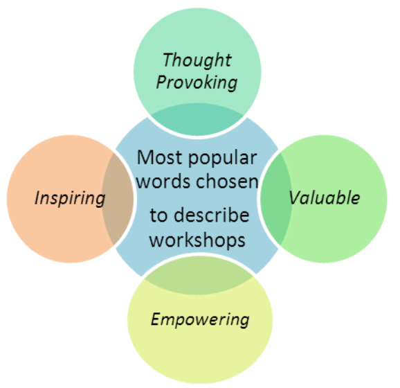
Diagram 1 - Participants Views on Workshops

Across events, participants were asked what they had found most valuable and what might be improved. The chance to network, time out for reflection, guest speakers and the practical tools which could be transferred into practice were valued most highly.